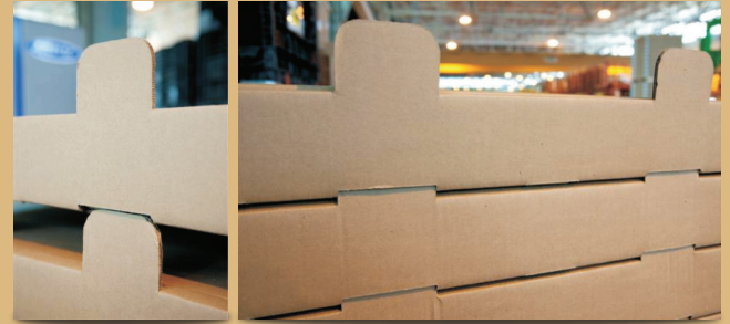
EZ interlocking tabs provide maximum stability.