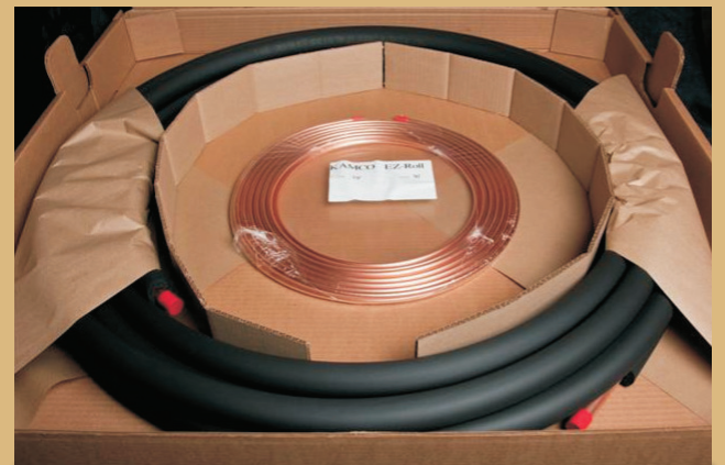
'Pizza-style' cartons with die-cut handles offers ease of transport on the job site, and eliminates master carton waste.