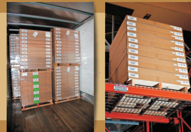
Double-stackable for transport and fully secured with our EZ interlocking tabs in racks.